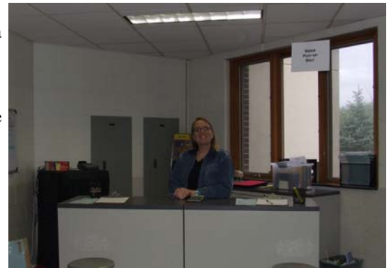
CHCA Scrip Shop

CHCA also relies heavily on their website, www.chca-oh.org to communicate the program. Parents ordering for the first time download a scrip application and are